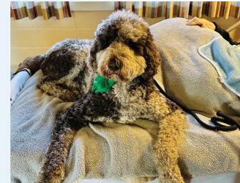
Therapy dog "Welly" is brought to visit patients by our volunteers.