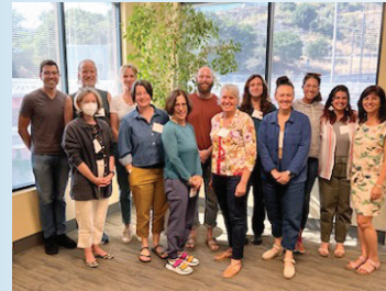
New Patient Care Volunteer Trainees.