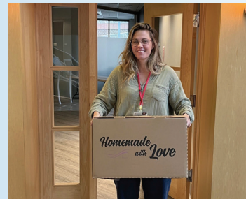
Volunteers deliver Thanksgiving meals to the families of some of our pediatric care patients.